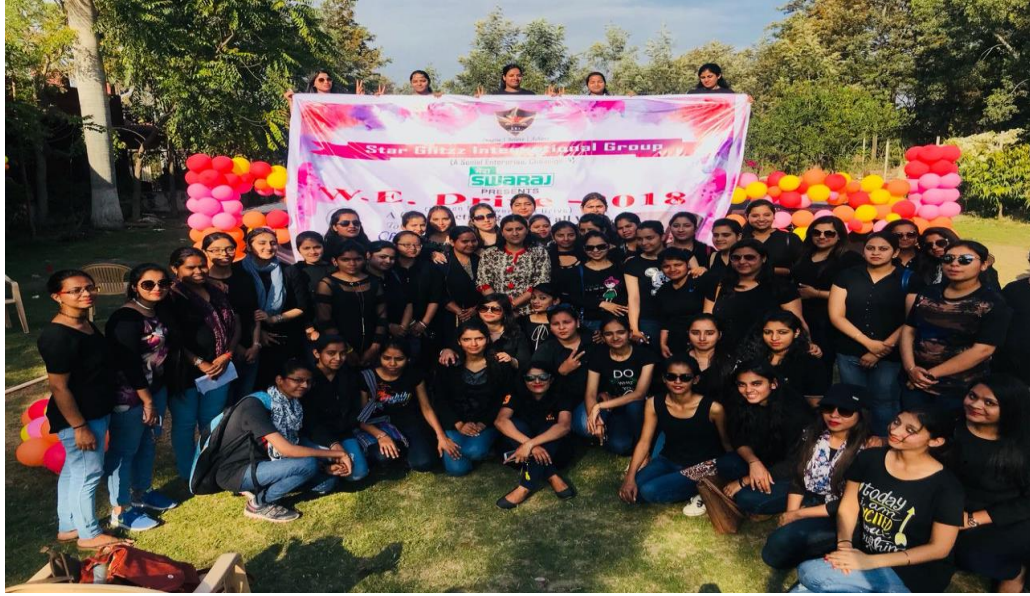
Star Glitz International Award for women empowerment