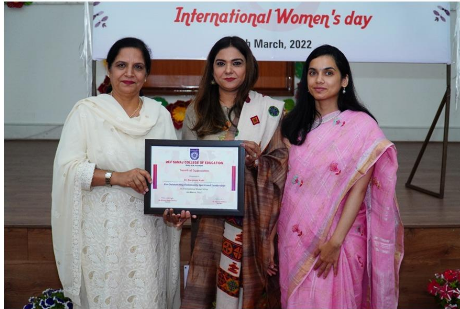
Award of Appreciation