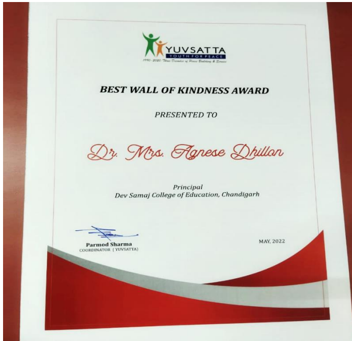
Best Wall of Kindness Award