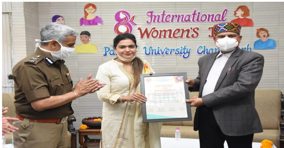
Outstanding Community Spirit and Leadership