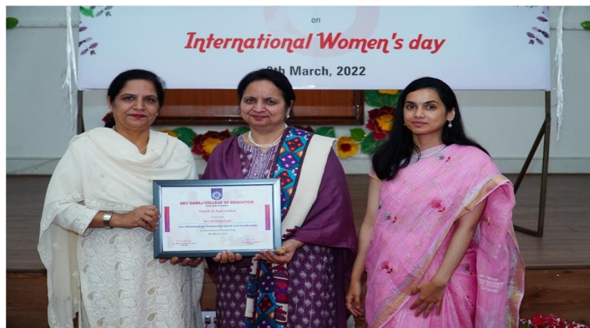
Award of Appreciation