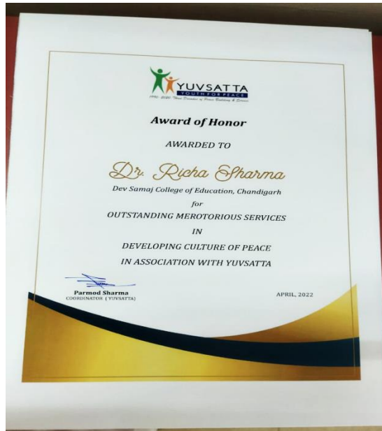
Award of Honor