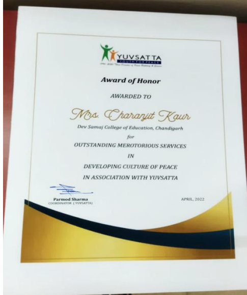
Award of Honor