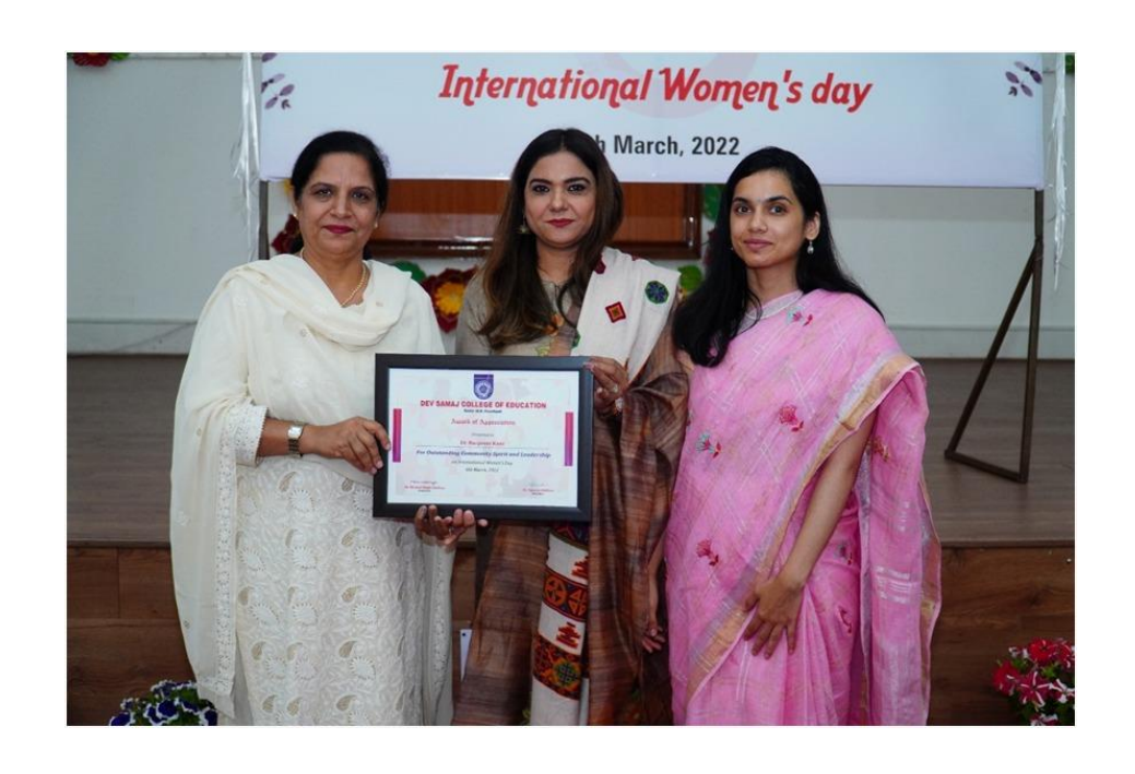
Award of Appreciation