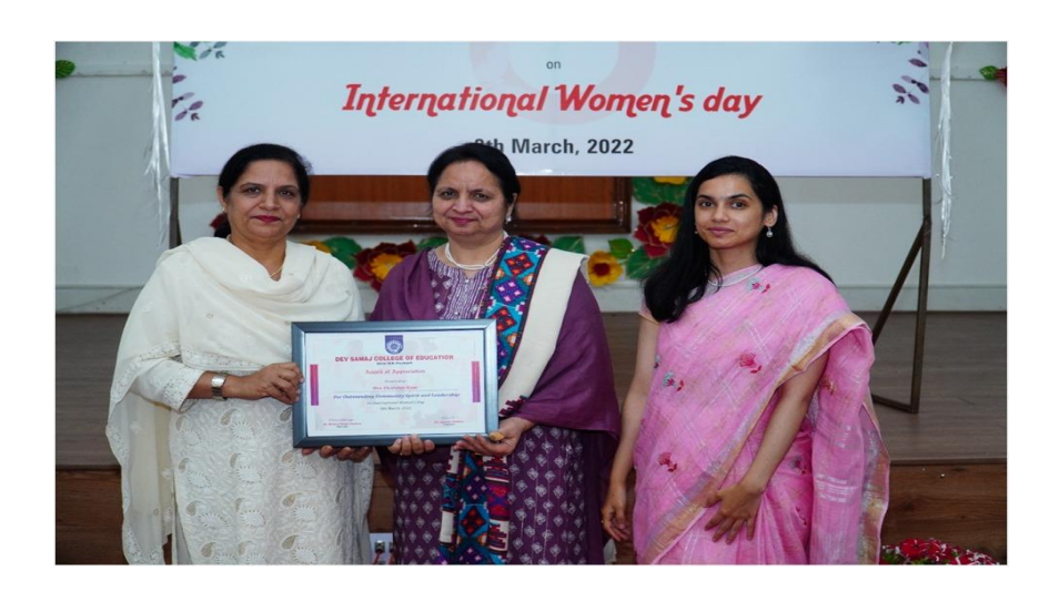
Award of Appreciation